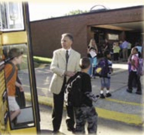
Originally built in 1969, Pilot Knob Elementary is receiving building upgrades and technology enhancements as part of a successful bond referendum conducted in the fall of 2004.

Community Expectation: Everyone in the Pilot Knob school community is respectful, responsible, cooperative and willing to try.