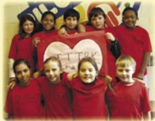
Our "Kindness Patrol" is one example of the innovative spirit at Pilot Knob. TTTBK stands for Take Time To Be Kind.